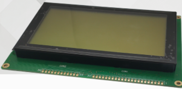
240x128 COB Graphic LCD Module