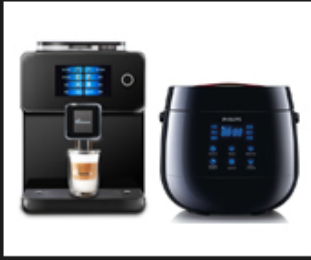
01 Civilian equipment