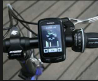
03 Traffic instrument