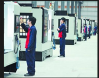
08 Control system