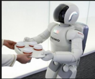
06 Smart device