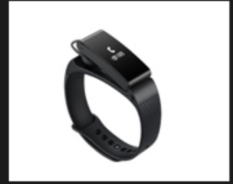
04 Mini screen