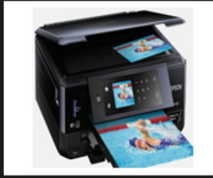
02 Office tools