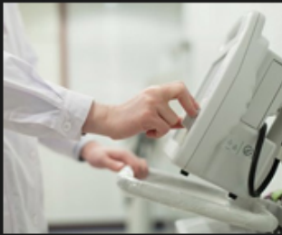
05 Medical and beauty equipment