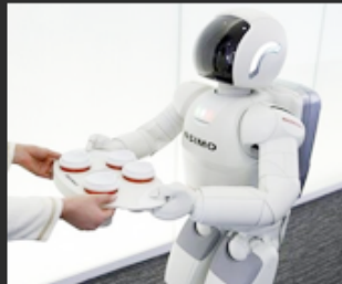
06 Smart device