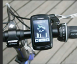
03 Traffic instrument