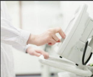
05 Medical and beauty equipment