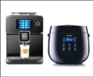
01 Civilian equipment