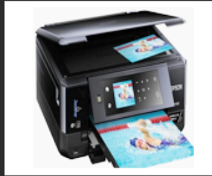
02 Office tools