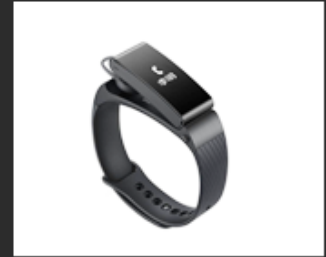
04 Mini screen