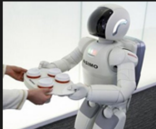
06 Smart device