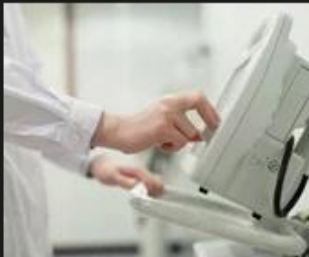
05 Medical and beauty equipment