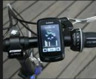
03 Traffic instrument