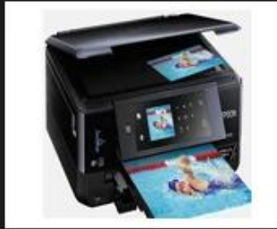
02 Office tools