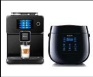
01 Civilian equipment