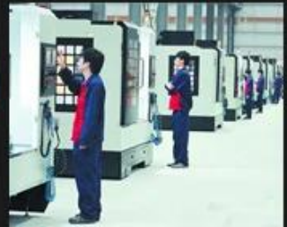
08 Control system