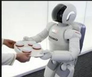
06 Smart device