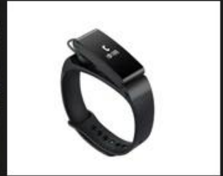
04 Mini screen