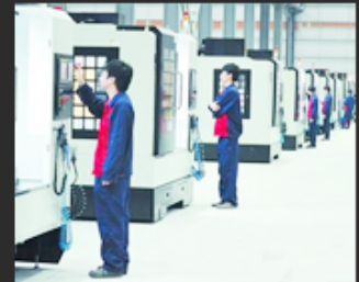
08 Control system