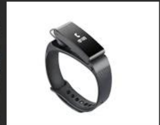
04 Mini screen