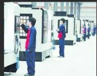
08 Control system