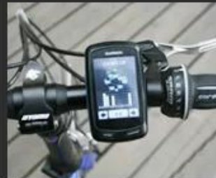
03 Traffic instrument