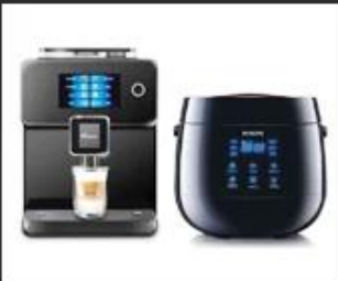
01 Civilian equipment