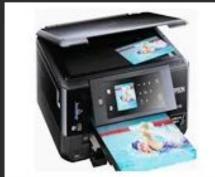
02 Office tools