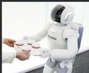
06 Smart device