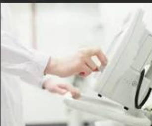
05 Medical and beauty equipment