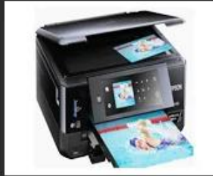
02 Office tools