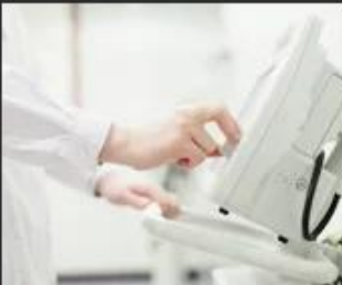
05 Medical and beauty equipment