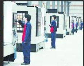
08 Control system