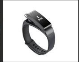
04 Mini screen