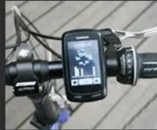
03 Traffic instrument