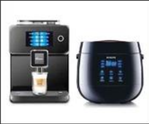
01 Civilian equipment