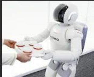
06 Smart device